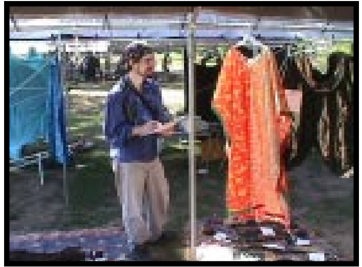
Adequate well-lit areas and tables for displaying cultural entries should be provided if you intend to hold an arts & sciences competition.

This is the time to make sure that any 'crats' are fulfilling their obligations and that any necessary supplies are acquired. This is the period between advertising and the actual event date. During this phase, you have to do any preplanning and provide any required props such as fabrication of costumes, making targets or boundary rings for events, or