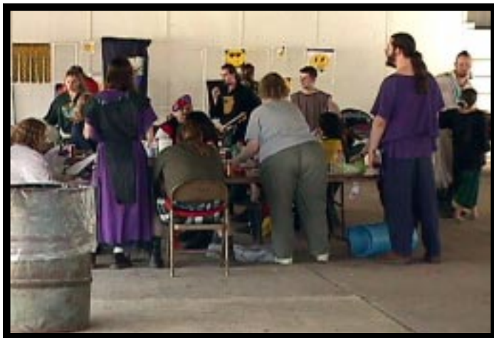
Well organized sign-ins allow for speedy entry, accurate attendance estimations, and a good record of who attended your event after it is over.

Security-o-crat - Responsible for event security and attendee safety. Responsible for enforcing site regulations as well as any state and local ordinances that might become relevant.