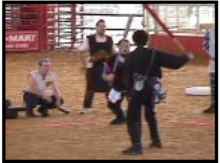
Well lit areas, clearly delineated rings, and sufficient reeves are all keys to a successful warskill tourney.

Once you have all the cost variables (site, feast, prizes, miscellaneous, etc.) divide that amount by the number of people you expect to attend: that is your base gate fee that will be charged to everyone entering the site for purposes of attending the Amtgard event ( Example: Site use cost $300, feast will cost $150, Prizes for events cost $50; for a total of $500 to hold the event. You expect (conservatively) that 100 people will show up. $500 divided by 100 (people) would result in a base gate fee of $5 per person, just to break even ). If the base event fee is over $10, you should reconsider your options until you can find some way to lower costs to bring the fee down to below $10 per person. Optimally, you should adjust gate fee to recoup event costs and "a lil bit more" that will go back into the treasury to allow the next event holder to have an easier time of it. Normally adding $1-$2 to gate is permissible with the understanding that the excess funds go back into the group treasury for future events. A good average gate fee is $8-$10, which is usually $6-$7 per person for weekend-long site use, $1-$2 for feast and $1 for the hosting group's treasury. It is recommended that the