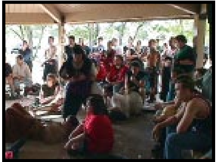
In hotter areas, try to choose a site that has shade enough for meetings and gatherings.

Attendance: Can the site comfortably accommodate everyone expected to attend? Is there sufficient space for parking? Is parking close to camping/activity areas or will arrangements for transportation of possessions need to be provided? Are the bathroom facilities sufficient for the number of people expected? Is there sufficient space for camping or will