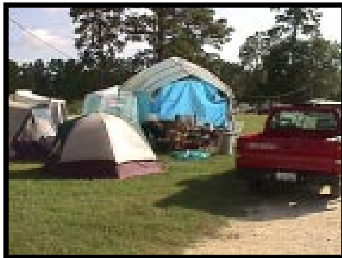
Portable shelters are available at most hardware stores for around $200. They often make for a great reusable retreat that can be borrowed for event needs.

ALWAYS recommended that you thoroughly explain the types of behavior that can be expected to site owners in advance and assure the site owner(s) that cleanup responsibility will be assumed by the event staff. Making sure that no one will be offended by the enthusiasm and revelry that accompanies Amtgard events beforehand will ensure that there will be no late-night surprise visits by local authorities or eviction from the site, and ensure that the site will be available for use in the future.