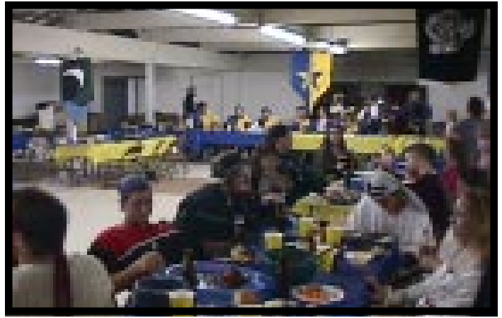
A good enclosed, well-lit area is a great for feasts and court activities.

Gate-o-crat - Responsible for collecting admission fees and signing in guests (including 24 hour attendance and admission).