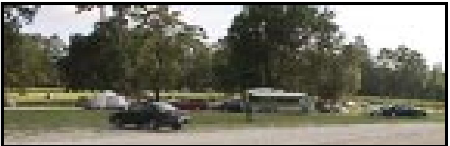
Parking that is convenient to camping areas may not be 'period' but it is always appreciated .

Cost: Is the site reservation fee economical? Are there hidden fees such as camping, water, electricity, sporting, trash disposal, grounds keeping, additional vehicle, or daily rates? Are certain areas of the park or amenities only available if they are pre-rented or