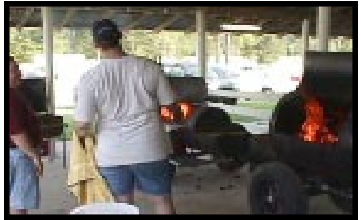
If you intend to have a ‘feast’, make sure there are cooking facilities on-site; if not, you’ll have to provide your own.

Privacy: Amtgardeners are often a loud lot and often prone to substance abuse and behavioral lapses. Make sure that any site you choose is AWARE of the type of behavior they can expect including the mock combat that will be occurring. Know all the regulations for a site before you agree on it and be willing to enforce any site-stipulated requirements. Laws broken or accidents that occur on the site will legally be the responsibility of the event organizer and, as such, need to be considered beforehand. It is