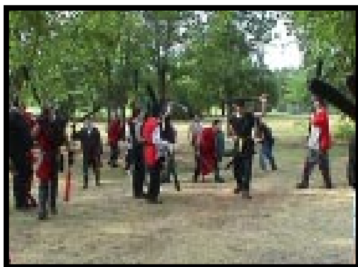
Adequate room for ‘ditching’ is a basic necessity for most any site.

Once you have found the site you intend to use, secure the necessary funds to reserve the land and any on-site amenities that may require rental fees (pavilions, kitchen facilities, food halls, bathrooms, etc.) If it is a local event, you should secure funds